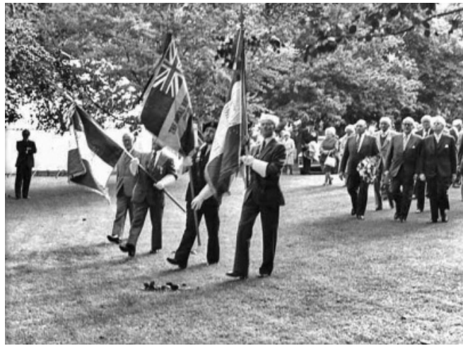
Scornet's death is commemorated every year