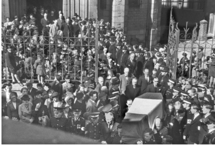
Another view of the funeral