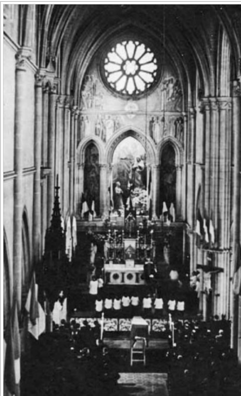
The funeral service at St Thomas' Church