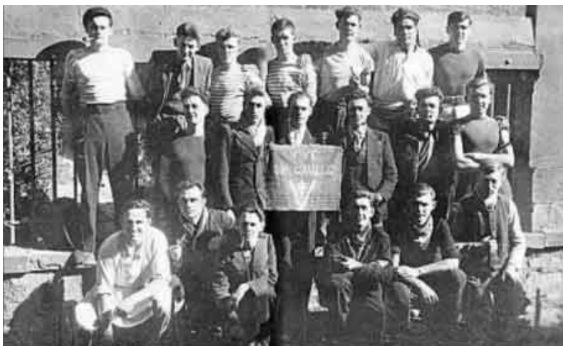
Scornet's companions photographed secretly in prison in Caen