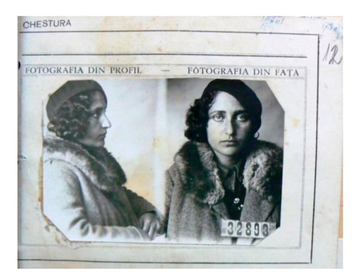
Figure 7. Photograph of Olga Bancic from the Siguranță's File.