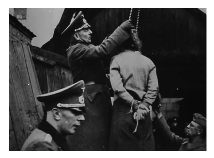
Figure 5. Masha Bruskina turns her back to the photographer and spectators.

Bruskina was fully aware that the letter that she wrote to her mother could be read by others, including censors, jailers, and acquaintances, as acknowledged by the family