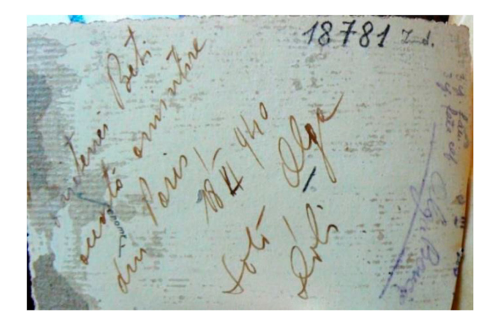
Figure 11. Verso of Figure 10. Paris, 18 June 1940. Romanian National Archives. ANIC-B, Fond 95. Dosar nr.18781.