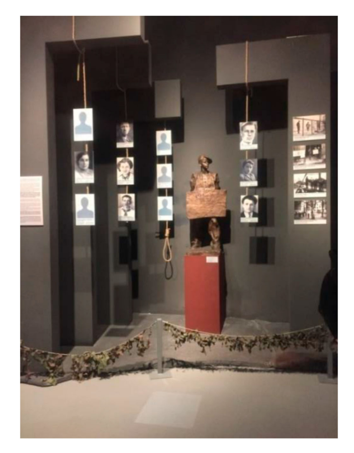
Figure 4. Alcove dedicated to the first execution of civilians in Minsk in October 1941. Belarusian State Museum of the History of the Great Patriotic War (BSMHGPW).

and museums, which compounded the Nazi contempt for the lives of those classed as subhuman through the exploitation of people's grief. Whereas the act of shooting the photographs violated the privacy of the condemned, depriving the victims of the last vestiges of dignity in death, displaying them perpetuated this violation, appropriating sorrow and mourning for the state's ends. However, if the Soviet aim was to stress resistance and heroism, for those close to them, these 'partisans' were, first and foremost, innocent victims, as Bruskina's uncle emphasised.