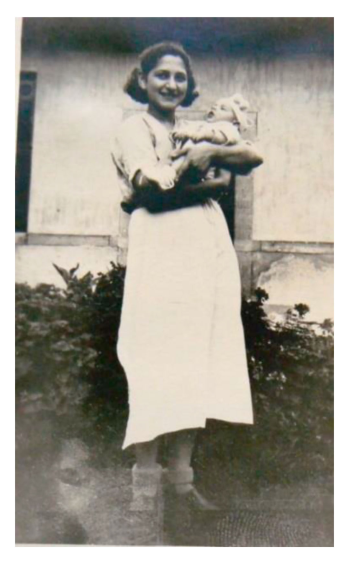
Figure 8. Olga Bancic holds Dolores in her arms.

on 16 November 1943. As Bancic was carrying a false identity card in the name of Marie Lebon, she was not immediately recognised. She maintained that she had only met Rayman that day and was a single mother acting as courier, unaware that she was carrying weapons or their provenance.<sup>56</sup>